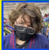
Max Trans Courage Award St. Joseph