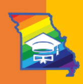
Anonymous Trans Courage Award St. Louis